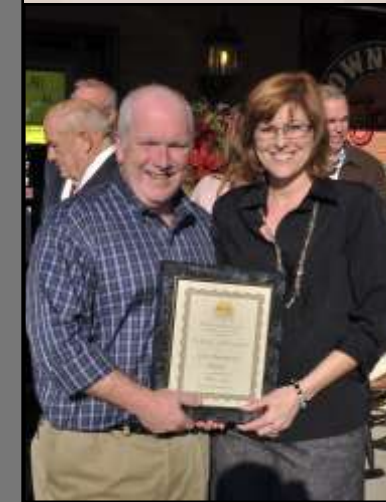
Joe's Downtown Market