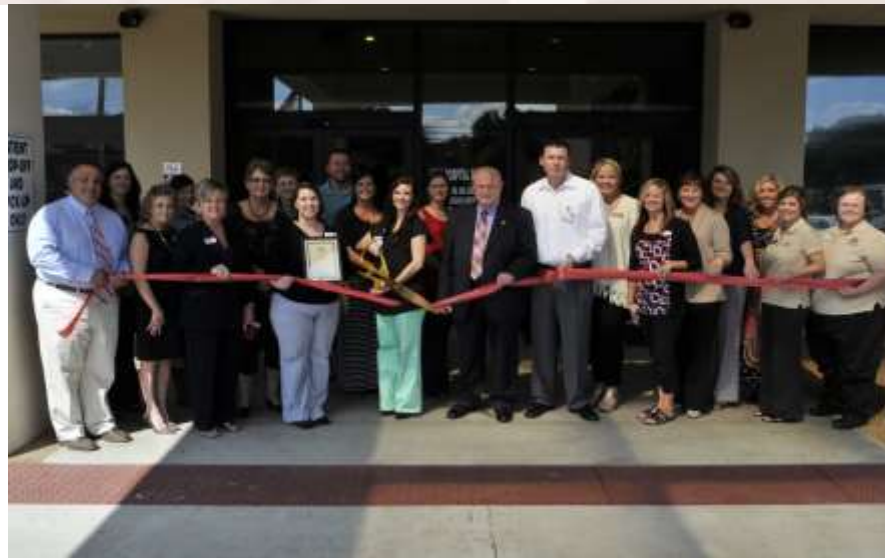
DRMC Healthy Woman Ribbon Cutting