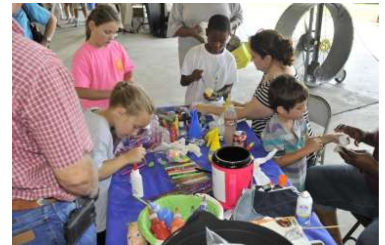
Family Fun at the Fall Festival