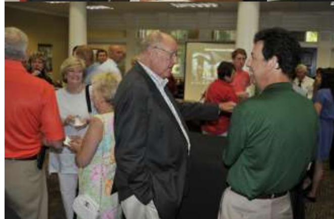
Discovery Park event at First State Bank