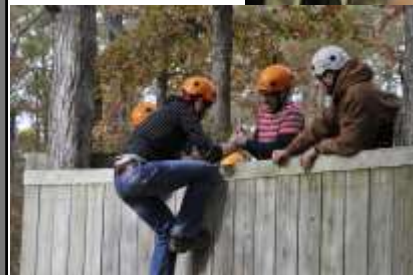
Leadership Team Building Activities at Camp Mack Morris 2013