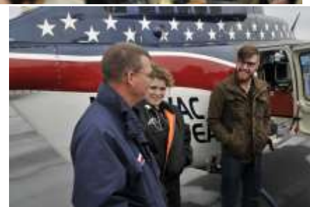
Adult Leadership visits with Air Evac Life Team at the Municipal Airport