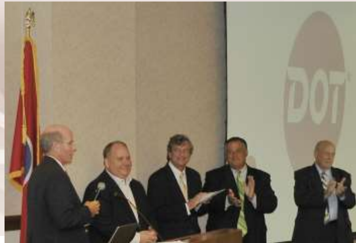
Announcement of Dot Foods at the Annual Membership Luncheon