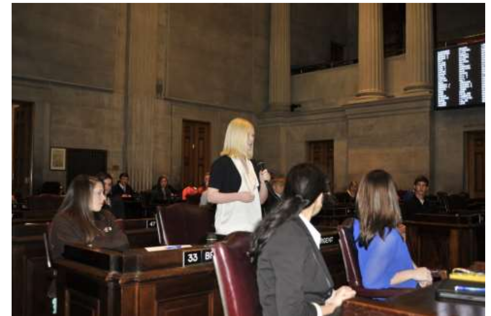
Youth Leadership introduce and vote on a mock bill in the Tennessee House.

The Chamber assisted with and helped to facilitate the 4th Annual Dyersburg Duckfest .