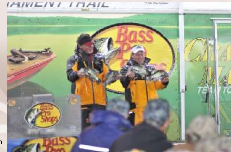
Crappie Masters weigh in at the Dyer County Fairgrounds