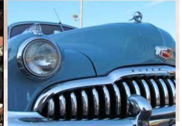
Fall Festival Antique Car Show