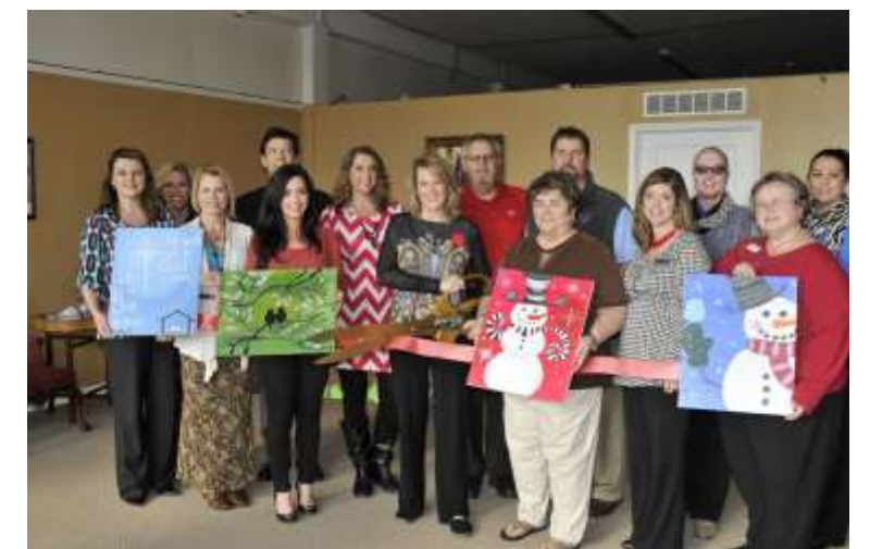
Paint and Gogh Ribbon Cutting Downtown